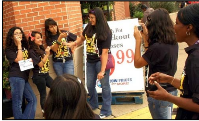
Houston-area teen girls participating in the “Tag It” activity creatively demonstrate how they are “above peer pressure.”

Teens from the Coalition of Behavior Health Services conducted a week of “Above the Influence” activities during a local art festival, including the “Tag It” activity, creation of an ATI art mural that traveled to various Houston-area locations, teen panel discussions, and a free concert by a local hip-hop dance group.