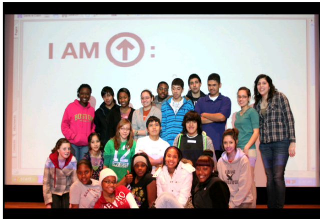
Michigan teens pose for a picture prior to doing the “Tag It” activity that would later be used in their 30-minute “Above the Influence” film.

Teens from the Kent County Prevention Coalition took on the challenge of making a movie discussing the negative pressures and influences in their lives, and how they rise above them. The 30-minute movie premiered at a local Kent County movie theater. Teens used the ATI Toolkit as a guide for the activities and discussions captured in the movie.