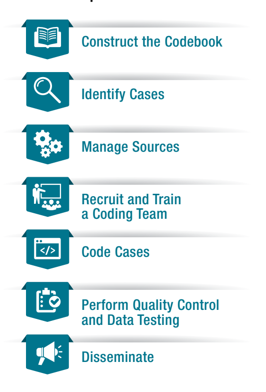
Exhibit 1. Steps To Build a Database

important issues, the questions they want to answer, and the theories they want to examine.