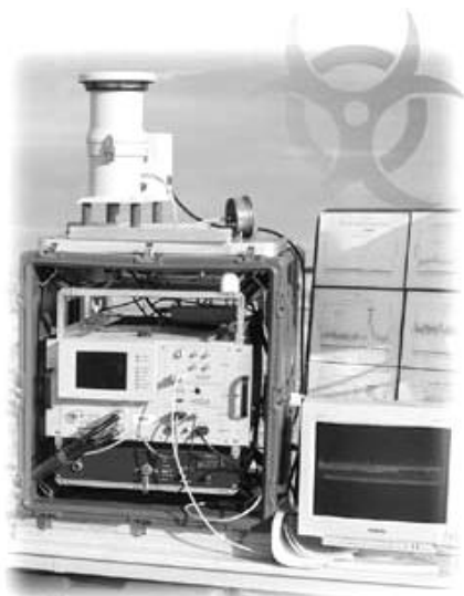
Figure 5-3. FLAPS II (component of the Canadian 4WARN System)

The FLAPS II device is part of the Canadian Integrated Biological Agent Detection System (CIBADS), a.k.a., the 4WARN detection suite. The CIBADS is an integrated system of components developed by the Canadian Ministry of Defense that currently contains a detector/trigger function, sample collection function, meteorological instrumentation, and communications equipment. A picture of the FLAPS II is presented in figure 5-3, and the 4WARN system from Canada is presented in figure 5-4.