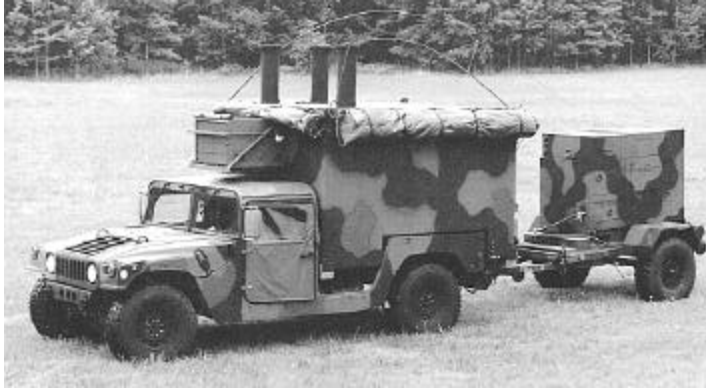
Figure 5-1. Biological Integrated Detection System (BIDS)