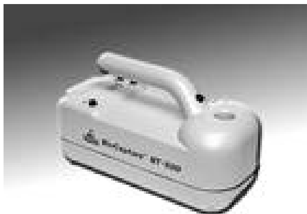
Figure 5- 8. BioCapture™ BT-500 Air Sampler, MesoSystems Technology, Inc.

The BioCapture™ BT-500 Air Sampler was developed by MesoSystems Technology, Inc., and incorporates the BioVIC™ Aerosol Collector, also developed by MesoSystems Technology, Inc. It is a hand-held, battery-powered air sampler that collects airborne samples for quantifying concentration levels. The microbes are captured and concentrated into an aqueous sample for analysis by whole cell rapid detection, nucleic acid, or other liquid-based sensor systems. The removable single-use cartridge can also be archived for evidence of a biological incident. An example of the BioCapture™ BT-500 Air Sampler is shown in figure 5–8.