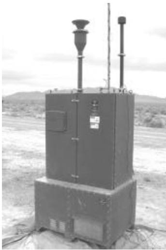
Figure 5- 6. Joint Biological Point Detection System (JBPDS)

The Smart Air Sampler System (SASS 2000) is a device that has been independently developed by Research International and also uses wetted-wall cyclone technology. This hand-held device can operate on battery power. An example of the SASS 2000 is shown in Figure 5–7.