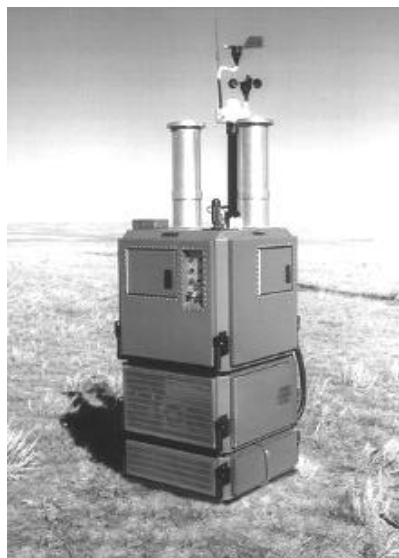
Figure 5-4. Canadian Integrated Biological-Chemical Agent Detection System (CIBADS)/4WARN

A variation of the FLAPS particle sizer is the Ultra Violet Aerodynamic Particle Sizer (UVAPS) that uses time-of-flight particle sizing, light scattering, and UV fluorescence intensity to nonspecifically detect biological agents in air samples. The UVAPS (as well as the FLAPS) is commercially available from TSI Inc., Particle Instruments.