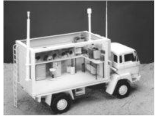
Figure 5-2. Cutaway of the UK Integrated Biological Detection System (IBDS)