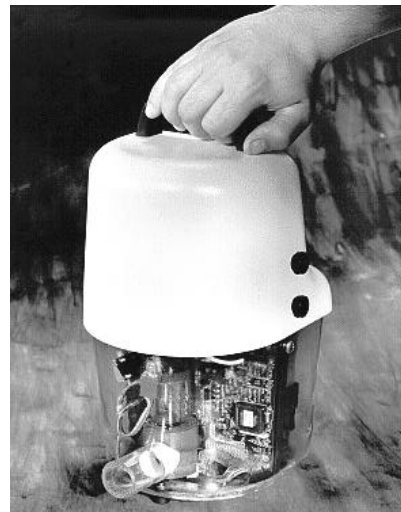
Figure 5- 7. Smart Air Sampler System (SASS 2000), Research International

The Portable High-Throughput Liquid Aerosol Air Sampler System (PHTLAAS) is a small hand-held device that uses technology similar to the wetted-wall cyclone technology. This instrument concentrates the contaminants found in a large volume of air into a small volume of liquid for ultrasensitive semiquantitative detection. Zaromb Research Corporation has independently developed this device.