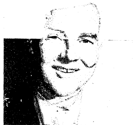
"The New Jersey Public Advocate's Center for Public Dispute Resolution is an exciting experiment in the use of alternative methods of resolving society's conflicts." Governor Thomas Kean, New Jersey

Adler: The most difficult challenge involves the opportunistic nature of this work. It is very difficult to do a strategic plan for the use of dispute resolution methods. That's the most frustrating aspect for me. I've been trying to figure out how we assess in the widest possible way the potential uses of dispute resolution in Hawaii in various settings and establish some priorities in the effort. We have not succeeded in putting together a coherent plan that cuts