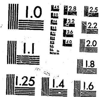
MICROCOPY RESOLUTION TEST CHART NATIONAL BUREAU OF STANDARDS-1963-A

This microfiche was produced from documents received for inclusion in the NCJRS data base. Since NCJRS cannot exercise control over the physical condition of the documents submitted, the individual frame quality will vary. The resolution chart on this frame may be used to evaluate the document quality.