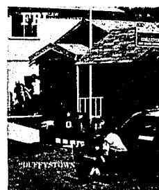
The Cover: "Duffystown" provides realistic exercises in tactical training. See story p. 16.

Federal Bureau of Investigation United States Department of Justice Washington, D.C. 20535