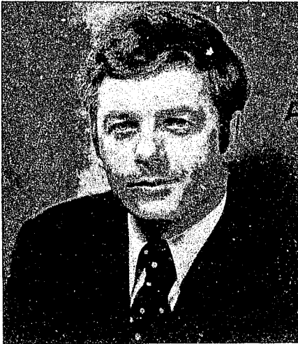
MESSAGE FROM THE ATTORNEY GENERAL JOSEPH E. BRENNAN

FROM THE OFFICE OF THE ATTORNEY GENERAL OF THE STATE OF MAINE