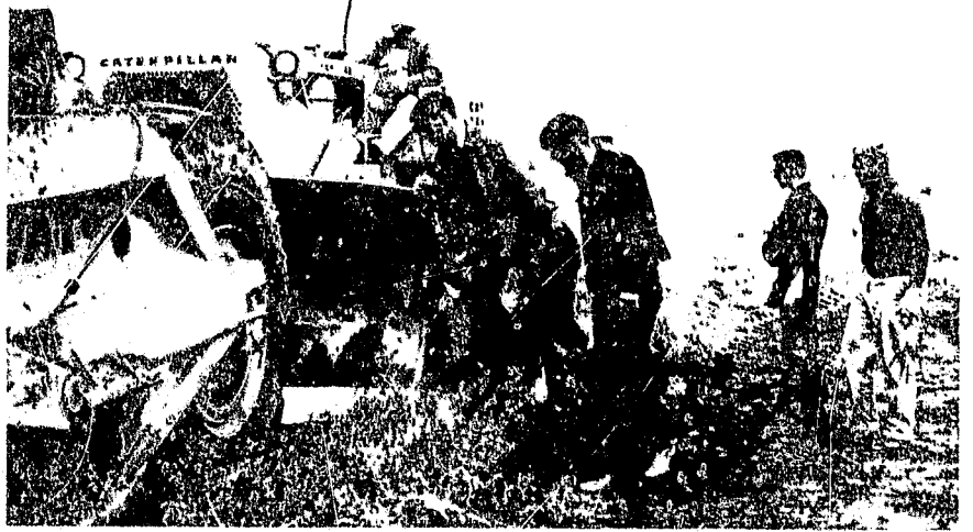
Figure 5. When heavy power equipment is used to locate graves, care should be taken to check carefully for soil color changes, grave outlines, and/or bones.