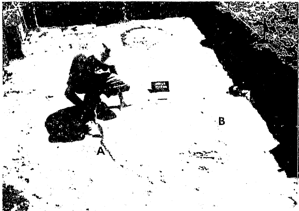
Figure 1. Outline of a 200-year-old grave before being exposed by excavation.

It is a wise practice to photograph the excavation at various stages and include identification and direction markers. The system used in figure 2 is one developed some years ago by the Smithsonian Institution. The first