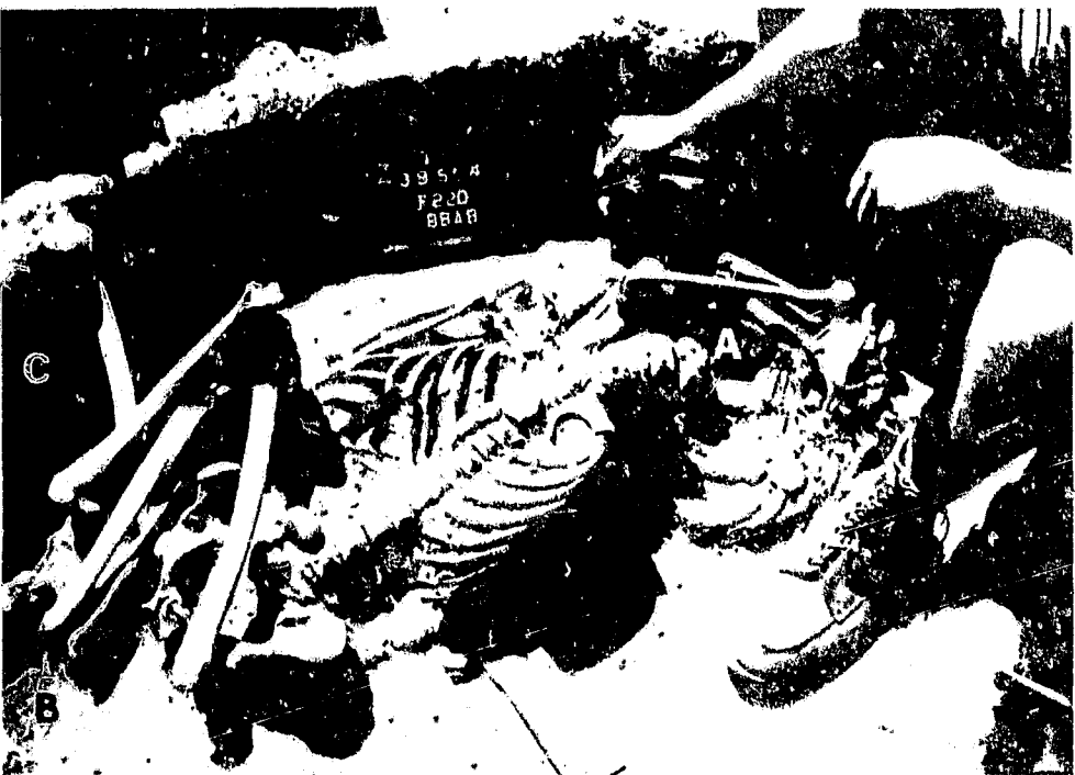
Figure 3. Leaving every bone in place while uncovering the skeleton allows for reconstruction of events surrounding the burial.

number or numbers is the alphabetical listing of the State (39 is South Dakota). The system was devised before Alaska and Hawaii were added, so they are 49 and 50, respectively. The next two letters (both capital let-