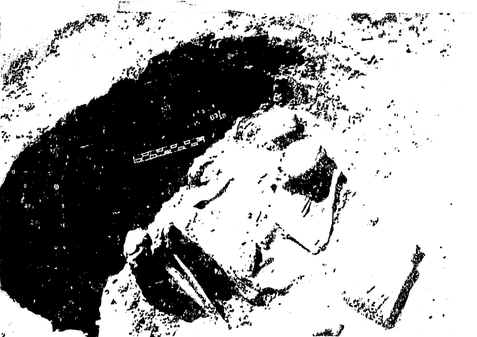
Figure 2. Removal of dirt from the original grave pit reveals the burial place of an adult and child.