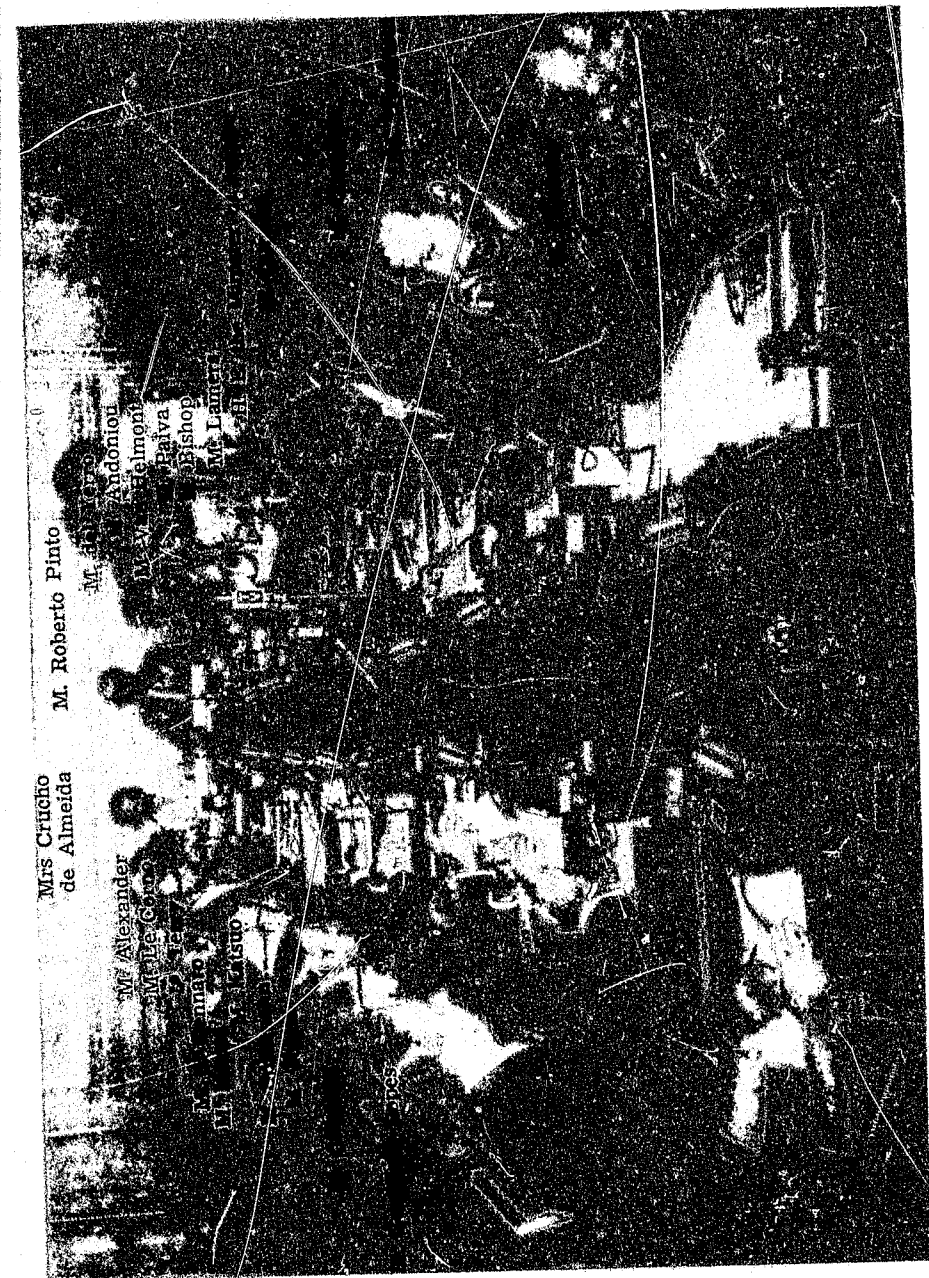
Opening session — 22nd September 1969 The speech delivered by Professor ALMEIDA COSTA, Minister of Justice