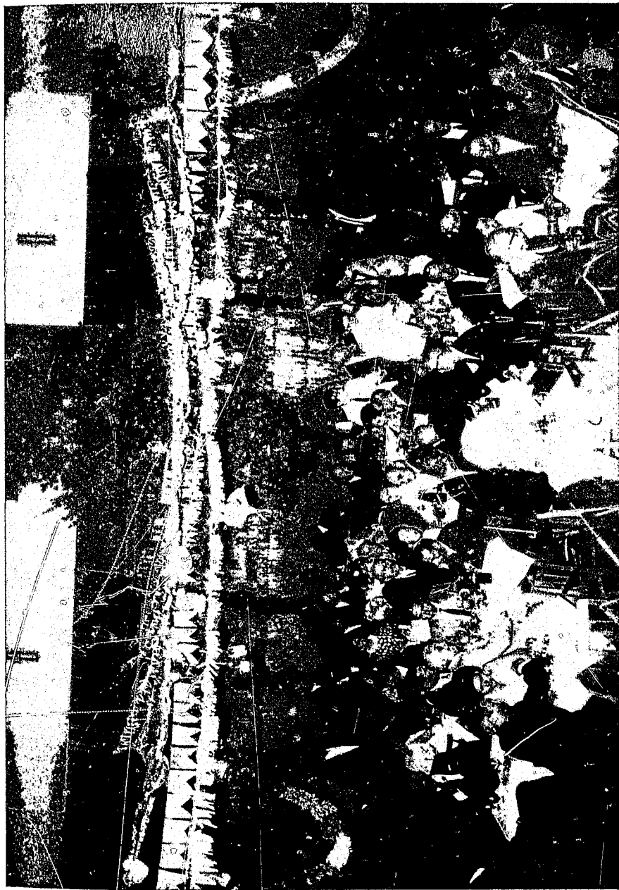
Reception and artistic display at Alcoentre