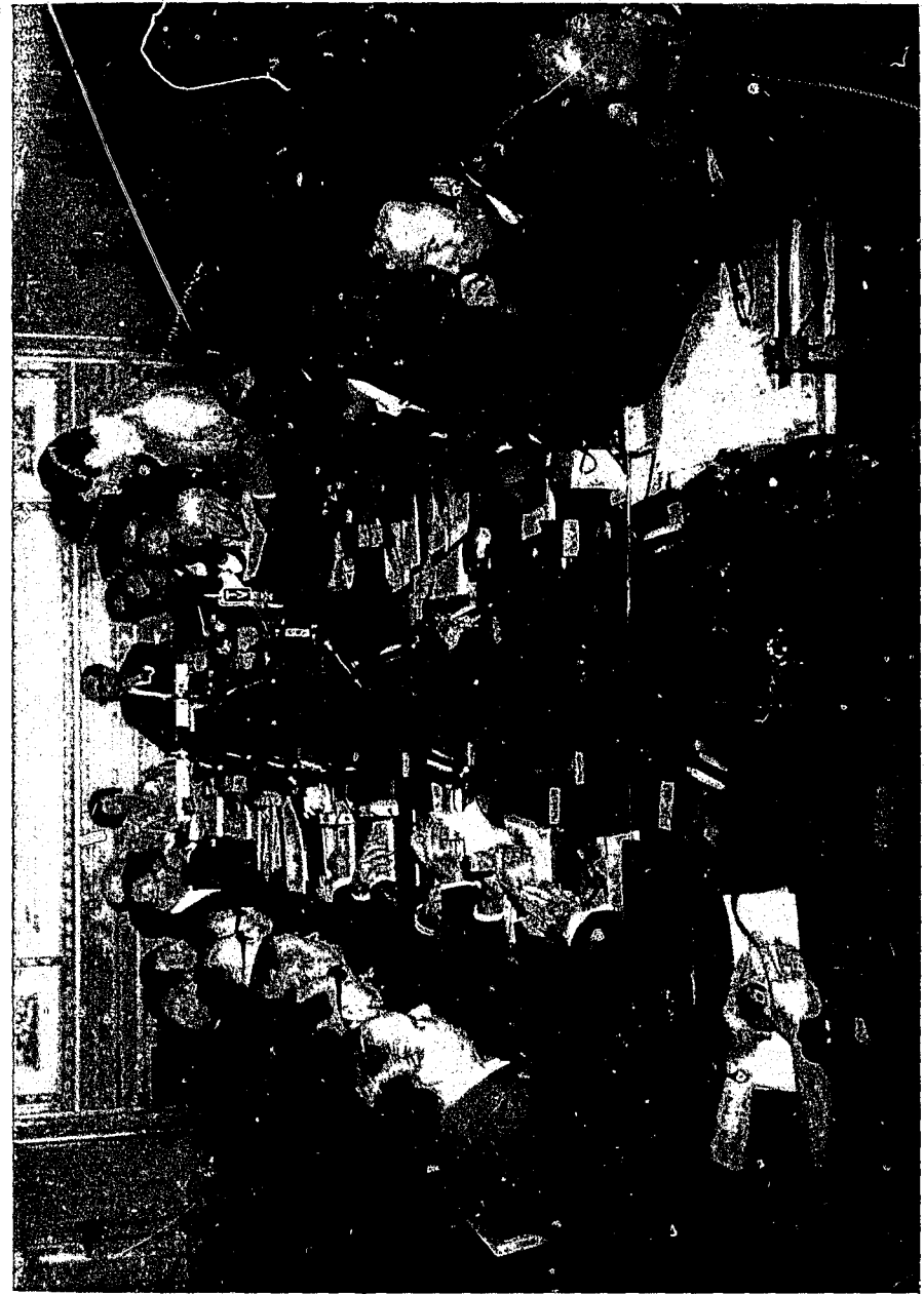
Opening session — 22nd September 1969 The speech delivered by Professor ALMEIDA COSTA, Minister of Justice