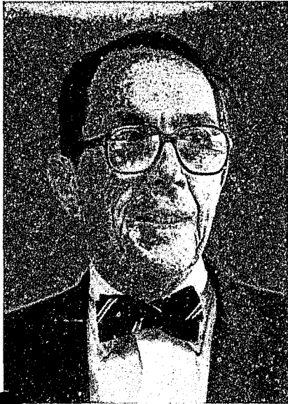
WILLIAM W. SCHWARZER

A central fact about litigation today is that the knowledge explosion has reached the courtroom—more and more decisions of cases rest on subject matter inherently unfamiliar to the decision maker. Liability determinations often turn less on the defendant's behavior—whether the defendant used due care or acted in a reasonable fashion—than on the characteristics and effects of products or substances. The question often is not whether a manufacturer or designer acted reasonably but rather whether a product increased the risk of harm; a question of pilot or controller error, for example, can become one about whether the air traffic control software was defective.