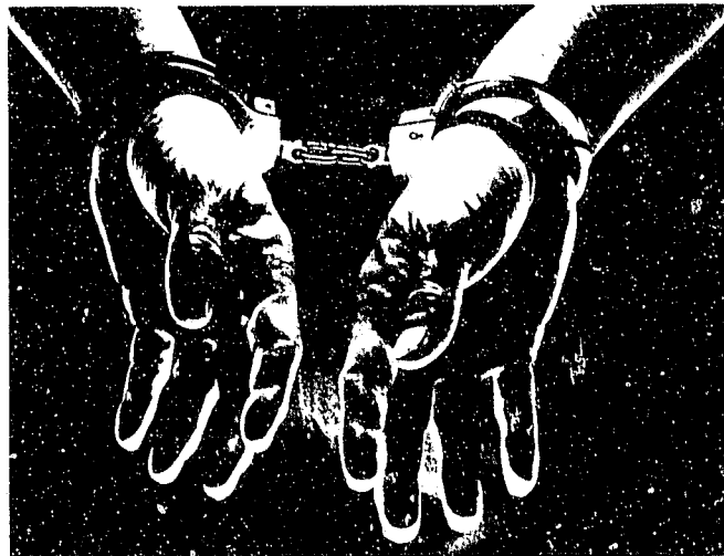
A tough new anti-drug police task force is now on the streets in Maricopa County enforcing our already tough drug laws. And if they catch you with drugs, they're taking you to jail. You then face felony charges, a prison sentence and stiff financial penalties. Or pay to enter a year-long rehab program. All of which means drugs are no longer the fashionable thing to do.

DO DRUGS. DO TIME. Maricopa County Demand Reduction Program.