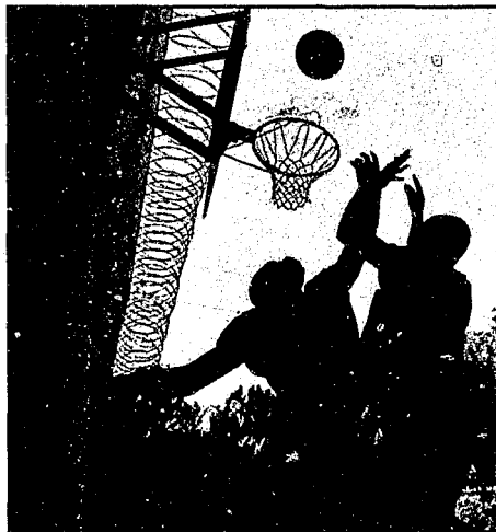
Inmates using recreational facilities at the Houston Processing Center, Texas.

Another experience the BOP had contracting for a secure facility was the agency's use of the Houston Processing Center under a contract that the Immigration and Naturalization Service (INS) has with Corrections Corporation of America. The Bureau's use ran from September 1984 to early 1987, when other contracts were established with providers in the southwestern United States. The Houston facility housed up to 80 short-term illegal aliens serving Federal sentences who were awaiting deportation proceedings following completion of