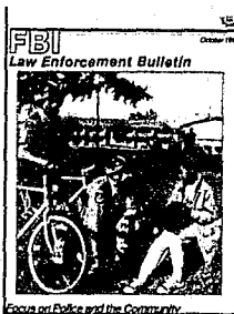
The Cover: SAT officers on patrol stop to make friends with a youth from the neighborhood. See article p. 2.

United States Department of Justice Federal Bureau of Investigation Washington, DC 20535