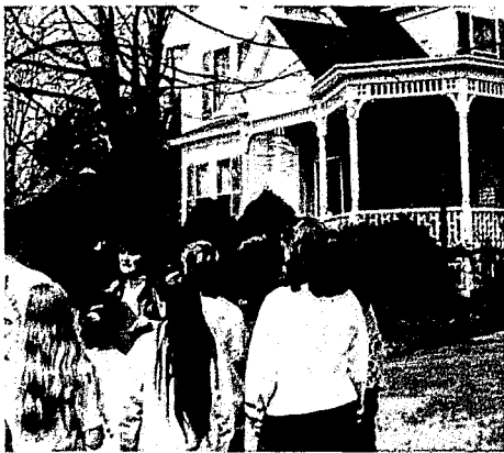
HNF takes students on architectural treasure hunts and enlists professional architects to explain the intricacies of blueprints.