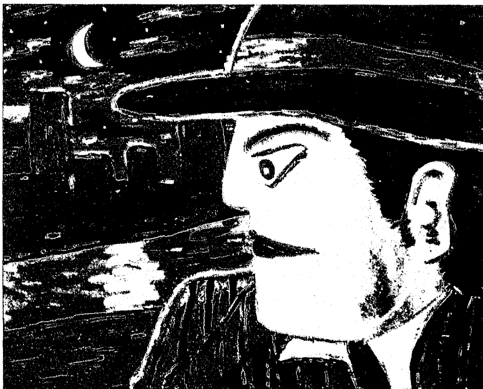
Carmen Cicero, "Crime Boss"

Over the past decade, the volume of state criminal appeals has increased at a rate far exceeding that of crimes, arrests, and trials. 1 The brunt of this pressure has been borne by