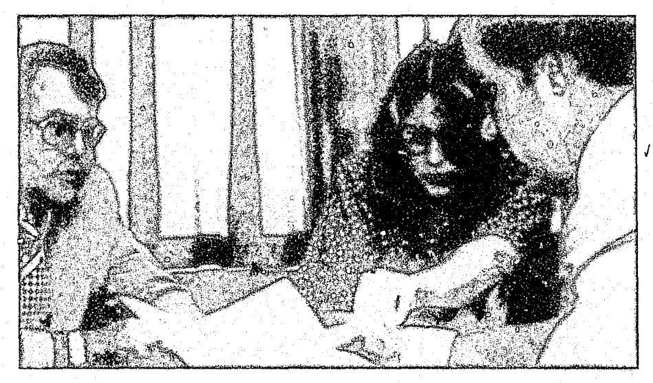
Planning for implementation includes determining major tasks and who will accept responsibility for them.

The stabilizing of organizational change is called institutionalization . It occurs when behaviors are established that, over time, benefit both the individual and the organization but do not require linkage to any single individual.