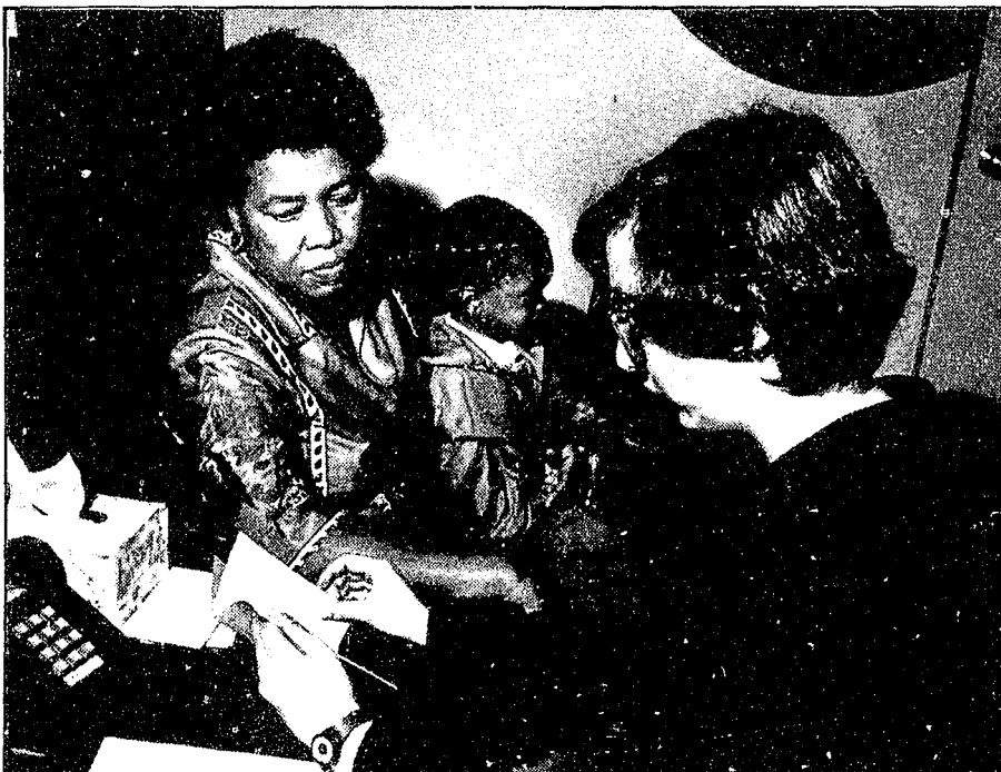
A counselor at New York's Victim Services Agency helps a victim cope with the aftermath of crime and assists her in working with the criminal justice system. More and more communities are offering victim counseling services.