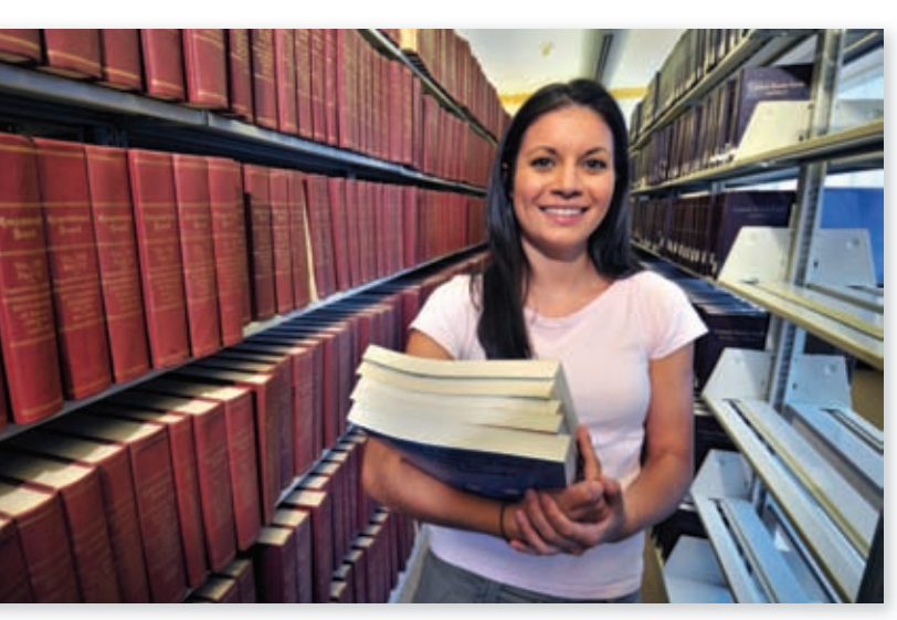
OJP'S OFFICE OF AUDIT, ASSESSMENT, AND MANAGEMENT REVIEWS THE AWARD-MAKING PROCESS AND RECOMMENDS ENHANCEMENTS TO INTERNAL CONTROLS.