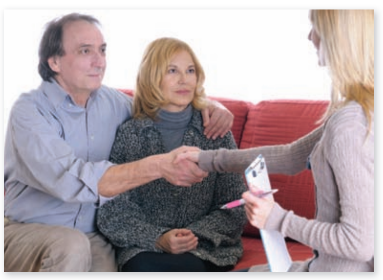
MENTALLY ILL INDIVIDUALS WHO HAVE COMMITTED LOW-LEVEL CRIMES GET HELP THROUGH THE JUSTICE AND MENTAL HEALTH COLLABORATION PROGRAM.