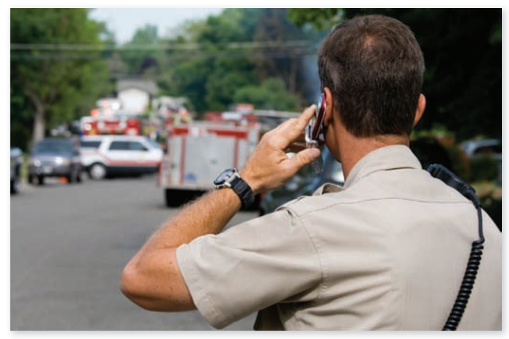
THE OFFICE OF JUSTICE PROGRAMS WORKS WITH STATE, LOCAL, AND TRIBAL CRIMINAL AND JUVENILE JUSTICE PRACTITIONERS TO RESPOND TO THE NATION'S PUBLIC SAFETY NEEDS.

he Office of Justice Programs' (OJP) close partnership with federal, state, local, and tribal justice systems is essential to providing a comprehensive and cohesive response to the nation's public safety needs. OJP provides innovative leadership, critical research and information, and essential funding to help communities implement programs and strategies.