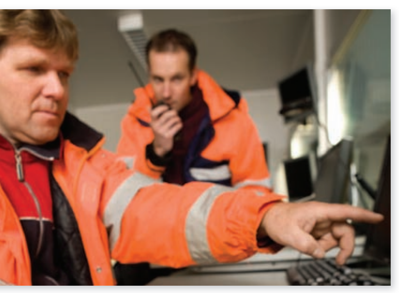
OJP'S TRAINING AND TECHNICAL ASSISTANCE HELPS FRONTLINE CRIMINAL JUSTICE PROVIDERS DO THEIR JOBS BETTER.

Hope; the electronic OVC publication Implementing SANE Programs in Rural Communities: The West Virginia Regional Mobile SANE Project; NU's TechBeat magazine; the NIJ Journal cover story "Police Lineups: Making Eyewitness Identification More Reliable"; the SMART Watch newsletter; and a video to be used at conferences and events to explain the work of OJP.