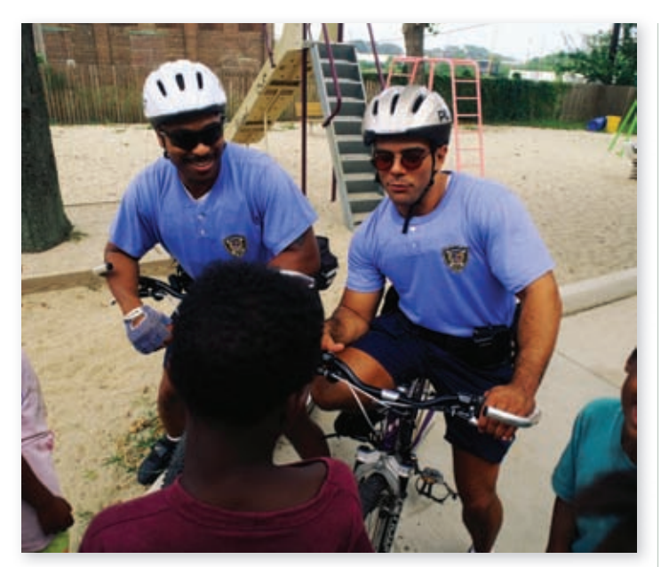
MORE THAN 40 PERCENT OF ANNUAL EDWARD BYRNE MEMORIAL JUSTICE ASSISTANCE GRANTS ARE TYPICALLY ALLOCATED FOR LAW ENFORCEMENT NEEDS.

Attorney General joined OJP leadership at the meeting to discuss priority areas such as children exposed to violence, indigent defense, justice reinvestment, the Second Chance Act, and violence against women.