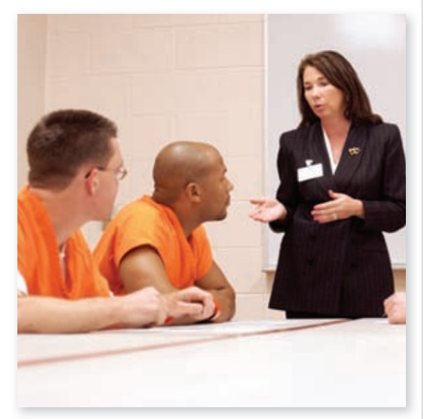
THE NATIONAL ADULT AND JUVENILE OFFENDER REENTRY RESOURCE CENTER HELPS PROVIDERS DEVELOP EVIDENCE-BASED REENTRY PROGRAMS.

In recognition of the need for these comprehensive services to prevent recidivism, the new National Adult and Juvenile Offender Reentry