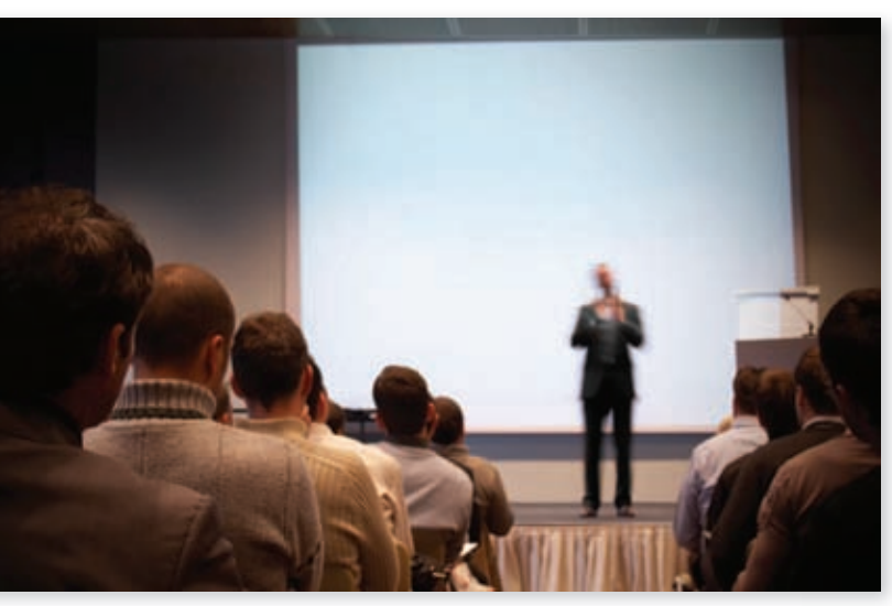
CRIMINAL JUSTICE EXPERTS SHARED THEIR RESEARCH WITH OJP LEADERSHIP AND STAFF.