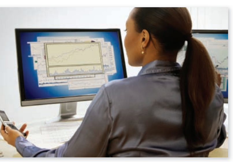
ALL OF OJP'S BUREAUS AND OFFICES PROVIDE ONLINE INFORMATION FOR STATE, LOCAL, AND TRIBAL CRIMINAL JUSTICE AGENCIES AND THE PUBLIC.

functions. In addition, BJS is working with other government agencies to create a publicly availableWeb page featuring the most recent data and trends on alcohol and crime.