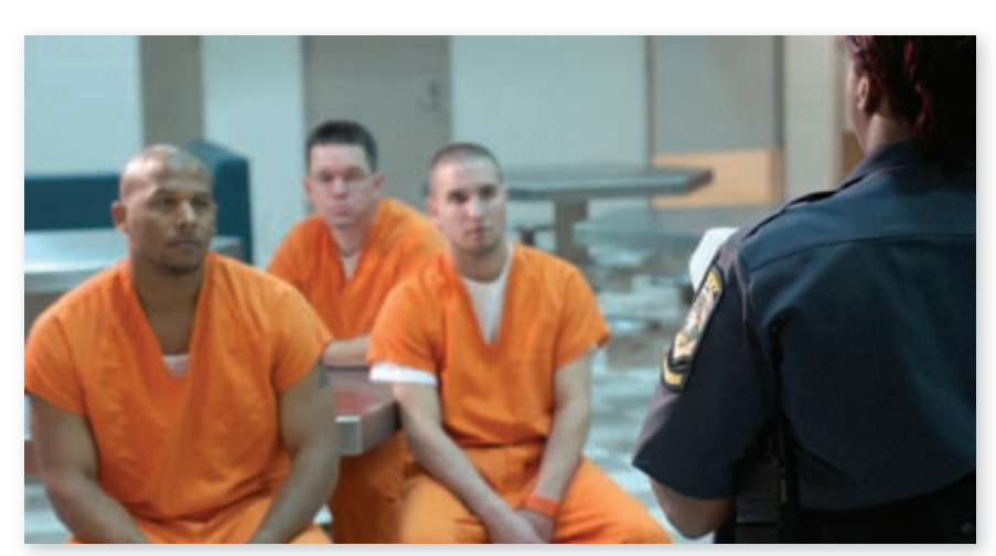
USING JUSTICE REINVESTMENT, TEXAS STOPPED THE GROWTH OF THE PRISON POPULATION AND INVESTED IN SUBSTANCE ABUSE AND MENTAL HEALTH TREATMENT PROGRAMS.

By focusing on evidence-based treatment strategies and new approaches for dealing with parolees, probationers, and mentally ill offenders, Kansas has cut parole revocation rates in half and reduced recidivism by more