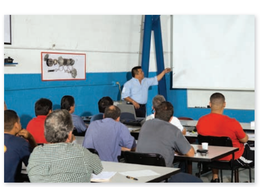
THE SEX OFFENDER MONITORING, APPREHENDING, REGISTERING, AND TRACKING OFFICE IS PROVIDING RESOURCES TO HELP JURISDICTIONS SUBSTANTIALLY IMPLEMENT THE SEX OFFENDER REGISTRATION AND NOTIFICATION ACT.

The SMART Office is using taxpayer dollars wisely to create a muchneeded resource that makes it easier and more cost effective for states,