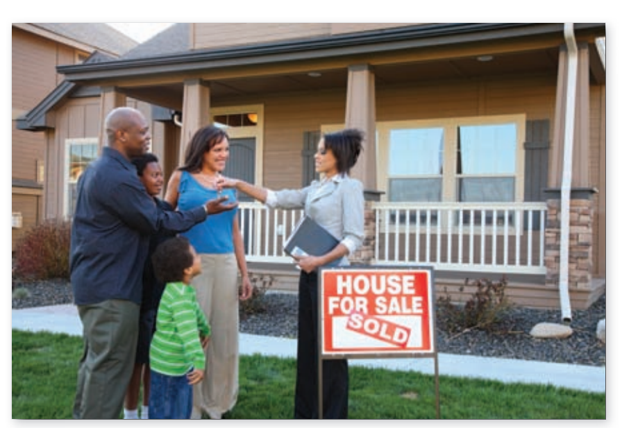
THE HUNTINGTON, WEST VIRGINIA, WEED AND SEED AREA WELCOMED 21 NEW HOMEOWNERS IN 1 YEAR.

The Huntington community's commitment is also demonstrated by the local funds the site is receiving. White explains that one of the primary goals of any Weed and Seed site is to become sustainable on the local level, so that the site can continue to serve the community after federal funding ends. Still a relatively new operation, the Huntington site is already sustaining all of its "seed" functions with funds from local agencies and organizations.