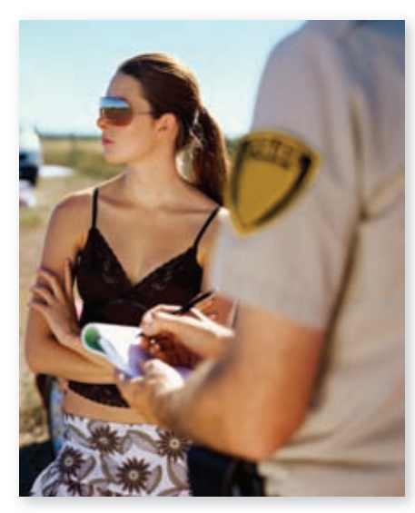
STALKING VICTIMS REPORTED THAT ENLISTING THE POLICE TO WARN THE PERPETRATOR WAS BELIEVED TO BE THE REASON FOR THE BEHAVIOR ENDING IN ONLY ABOUT 15 PERCENT OF THE CASES.

Victims of stalking are regular people who live in fear. They may be followed, harassed, chased,