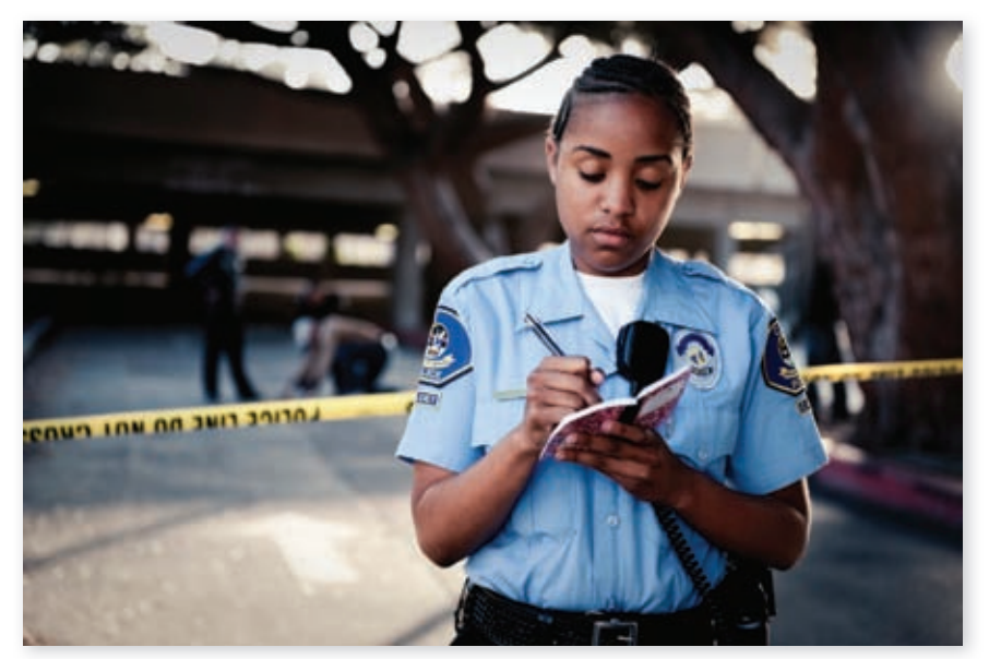
CEASEFIRE'S CREATIVE APPROACH TO VIOLENCE PREVENTION IS WORKING, ACCORDING TO THE REPORT EVALUATION OF CEASEFIRE-CHICAGO.

The exhaustive, 3-year study of CeaseFire's processes and outcomes was conducted by a team of researchers led by Wesley Skogan, a political