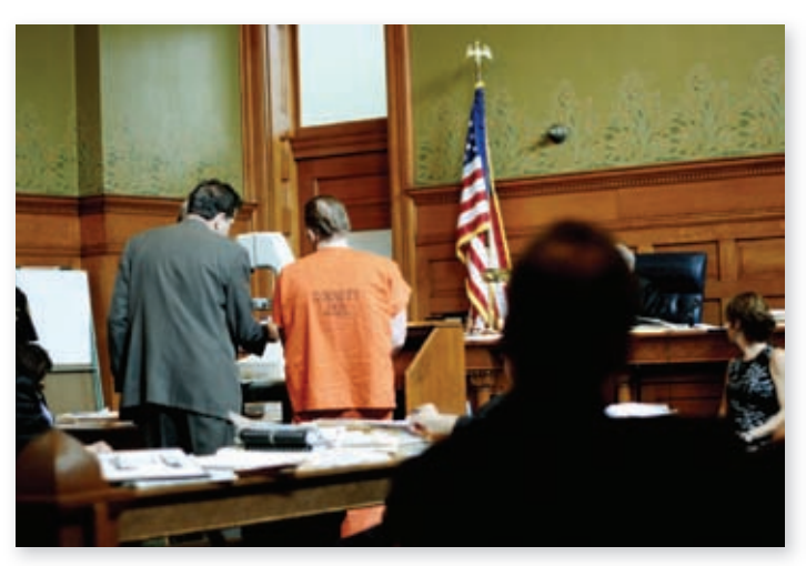
DRUG COURTS USE TREATMENT, MANDATORY DRUG TESTING, SANCTIONS, INCENTIVES, AND TRANSITIONAL SERVICES TO HELP NONVIOLENT, SUBSTANCE-ABUSING OFFENDERS BREAK THE CYCLE OF DRUG-RELATED CRIME.

with BJA, BJA receives invaluable recommendations on priority information-sharing issues; and the Global practitioners receive support for national promising practices and technology solutions. Progress was evident this past year in the increased national adoption of the National Information Exchange Model and the Nationwide Suspicious Activity Reporting Initiative as well as the development of privacy policy templates and impact assessments to ensure the protection of privacy and civil liberties. These tools will enable effective information sharing to meet the needs of justice practitioners in a safe and secure manner.