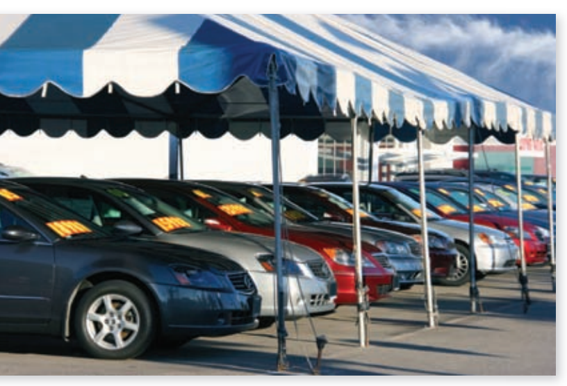
THE BUREAU OF JUSTICE ASSISTANCE WORKS WITH THE AMERICAN ASSOCIATION OF MOTOR VEHICLE ADMINISTRATORS TO PROTECT CONSUMERS FROM UNSAFE AND STOLEN VEHICLES.

The National Motor Vehicle Title Information System (NMVTIS) partnership between BJA and the American Association of Motor Vehicle Administrators protects consumers from fraud and unsafe vehicles and keeps stolen vehicles from being resold to the unsuspecting public. January 2009 marked the launch of a comprehensive Web site allowing individual