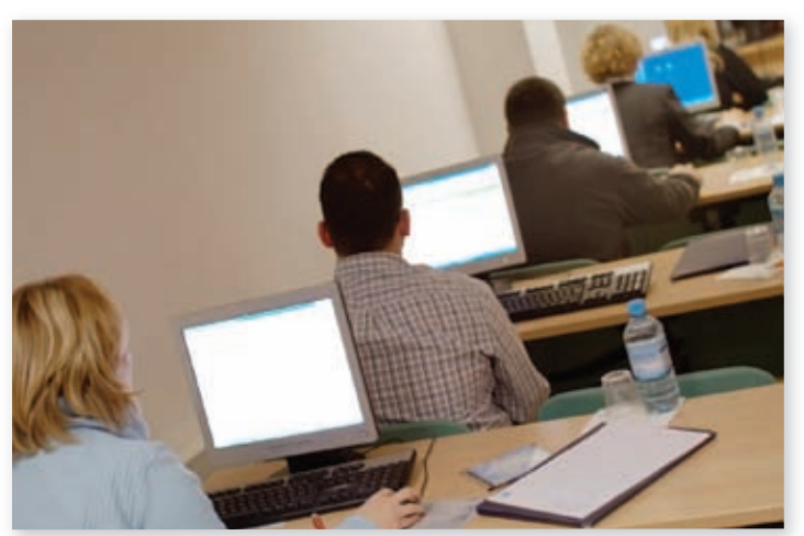
OJP'S OFFICE OF THE CHIEF FINANCIAL OFFICER OFFERED REGIONAL FINANCIAL MANAGEMENT TRAINING SEMINARS FOR GRANTEES.

The SMART Office responded to nearly 1,400 technical assistance requests concerning implementation of the Sex Offender Registration and Notification Act (SORNA) (see article on p. 46). Funding totaling $4.67 million for the implementation of SORNA was awarded to 8 states and 18 tribes. In September 2009, Ohio and the Confederated Tribes of the Umatilla Indian Reservation became