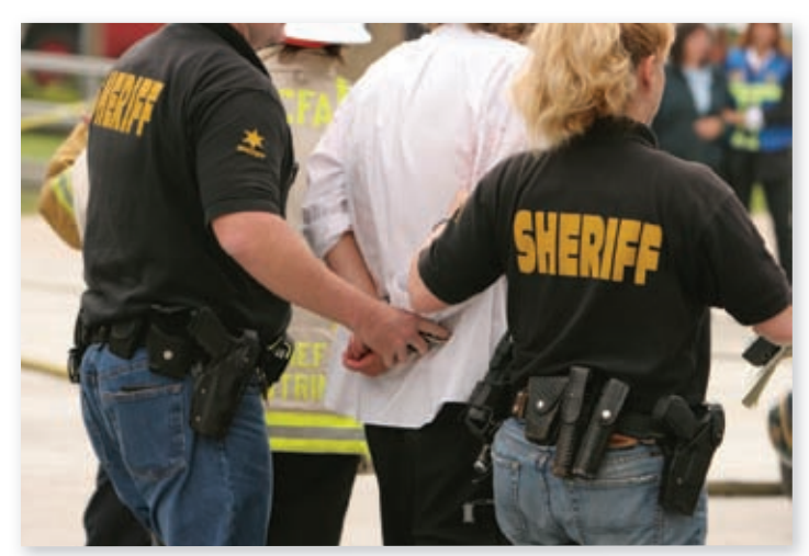
OJP FOSTERS COORDINATION BETWEEN ANTI-HUMAN TRAFFICKING TASK FORCES AND VICTIM SERVICE PROVIDERS.

During these tough economic times, CCDO also partnered with the IRS to assist low-income individuals with asset development through Volunteer Income Tax Assistance (VITA) Centers. This resulted in the processing of more than 29,000 tax returns, yielding