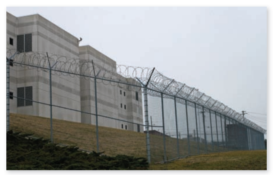
JUSTICE REINVESTMENT IS A UNIQUE STRATEGY THAT HELPS STATES BREAK THE CYCLE OF RECIDIVISM, AVERT PRISON EXPENDITURES, AND INVEST IN ALTERNATIVES TO INCARCERATION.

Several years ago, none of this existed and Texas was building prisons and filling them at a staggering rate. In 2007, with the prison population